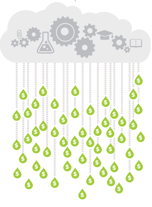
Altogether, for every $1 appropriated by Oregon lawmakers, the UO adds $55 to the economy.

Universities are rainmakers, growing our economy.